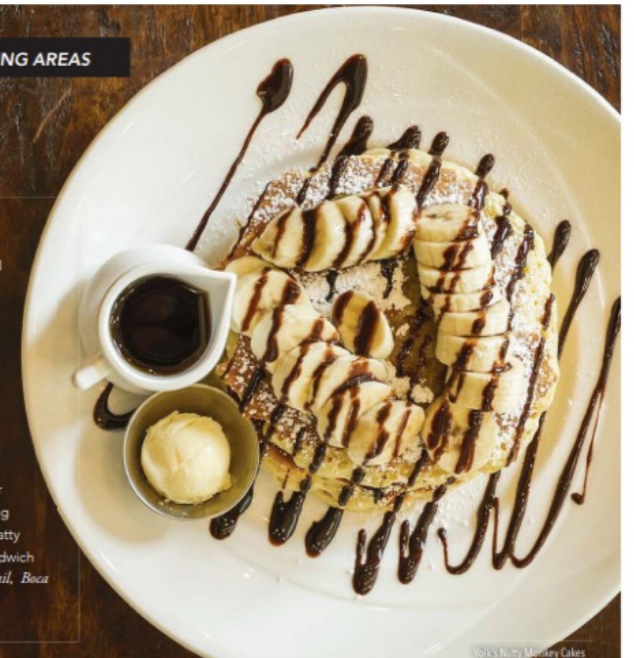
Yolk's Nutty Monkey Cakes

Breakfast is definitely the most important meal of the day at Yolk , Boca's new restaurant that already has a cultlike following at its Chicago location. The eatery offers signature "scramblers" and other mouthwatering favorites such as breakfast mac and cheese packed with ham, bacon and a sunny-side-up egg, and pancakes stuffed with bananas and chocolate chips, layered with peanut butter and drizzled with chocolate sauce. There's also a special coffee bar and a pickup window for breakfast on the go. Yolk also stays open during lunchtime, serving up salads, burgers, a killer patty melt and comfort foods like the pot roast sandwich and the grilled cheese. 5570 N. Military Trail, Boca Raton; 561.300.4965; eatyolk.com