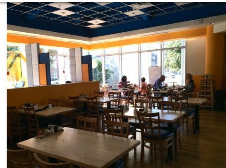
Light pours in through the windows at Yolk.