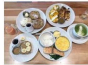
A Chicago breakfast restaurant has opened in Boca.

looked. Aesthetics aside, it was time to get to business. After sipping on my very frothy and tasty green tea matcha, I ordered the grilled salmon and poached eggs. Lying on a top of sautéed spinach, my sides were cheesy grits and banana nut bread French toast for a sweet and savory combination. The homemade Hollandaise sauce was velvety but not too rich, enhancing the favors of my meal instead of drenching my food.