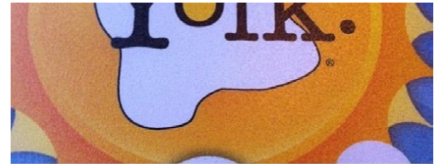
3. Yolk 1120 S Michigan Ave (at E 11th St), Chicago, IL Breakfast Spot · South Loop · 224 tips and reviews