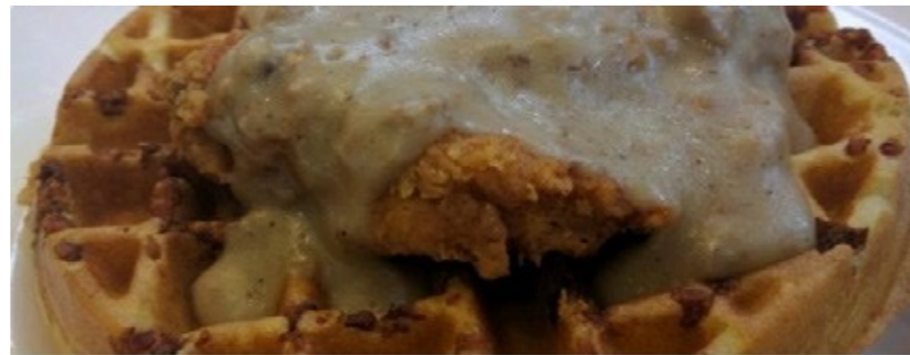
2. Yolk One Arts Plaza, Dallas, TX Breakfast Spot · Arts District · 18 tips and reviews