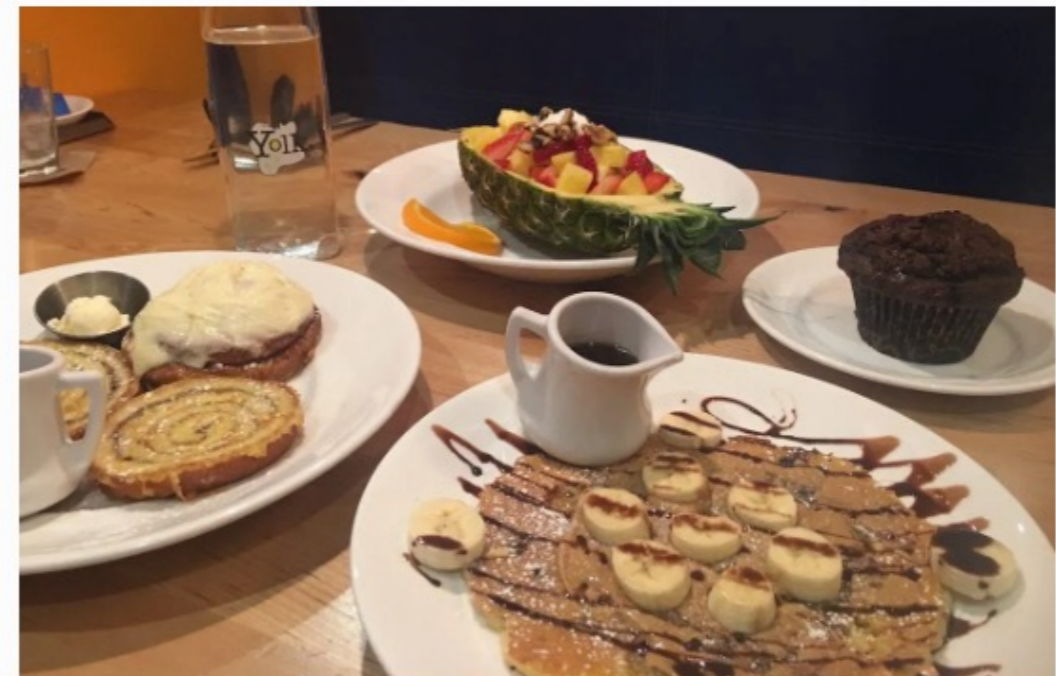
Breakfast at Yolk. LOIS ALTER MARK

Everyone agrees breakfast is the most important meal of the day.