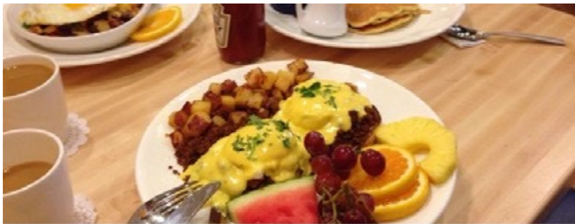
8. Yolk. 220 E South St (Alabama), Indianapolis, IN Breakfast Spot · Downtown Indianapolis · 18 tips and reviews