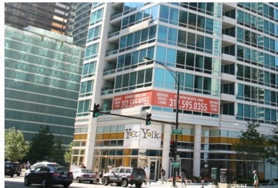
Yolk's Streeterville location